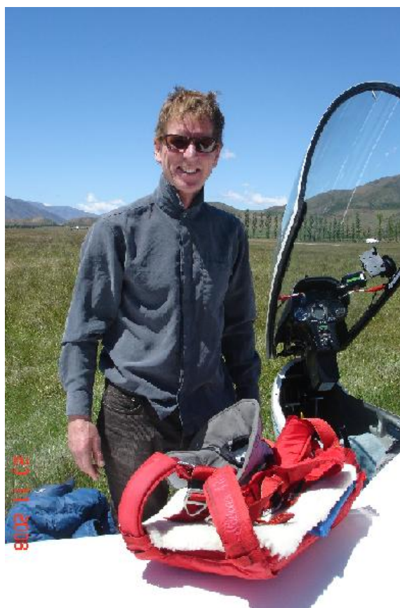
(Both competed in the Open Class)